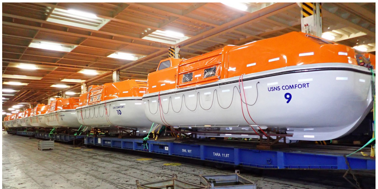
USNS Comfort lifeboats loading onto M/V Patriot @ POL Bremerhaven, Germany