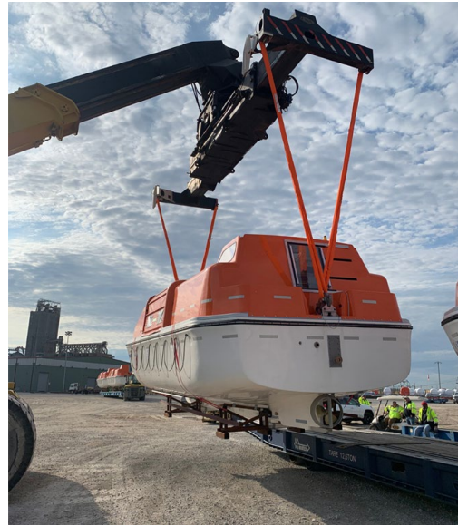
Lifeboats @ POD Mobile, Alabama